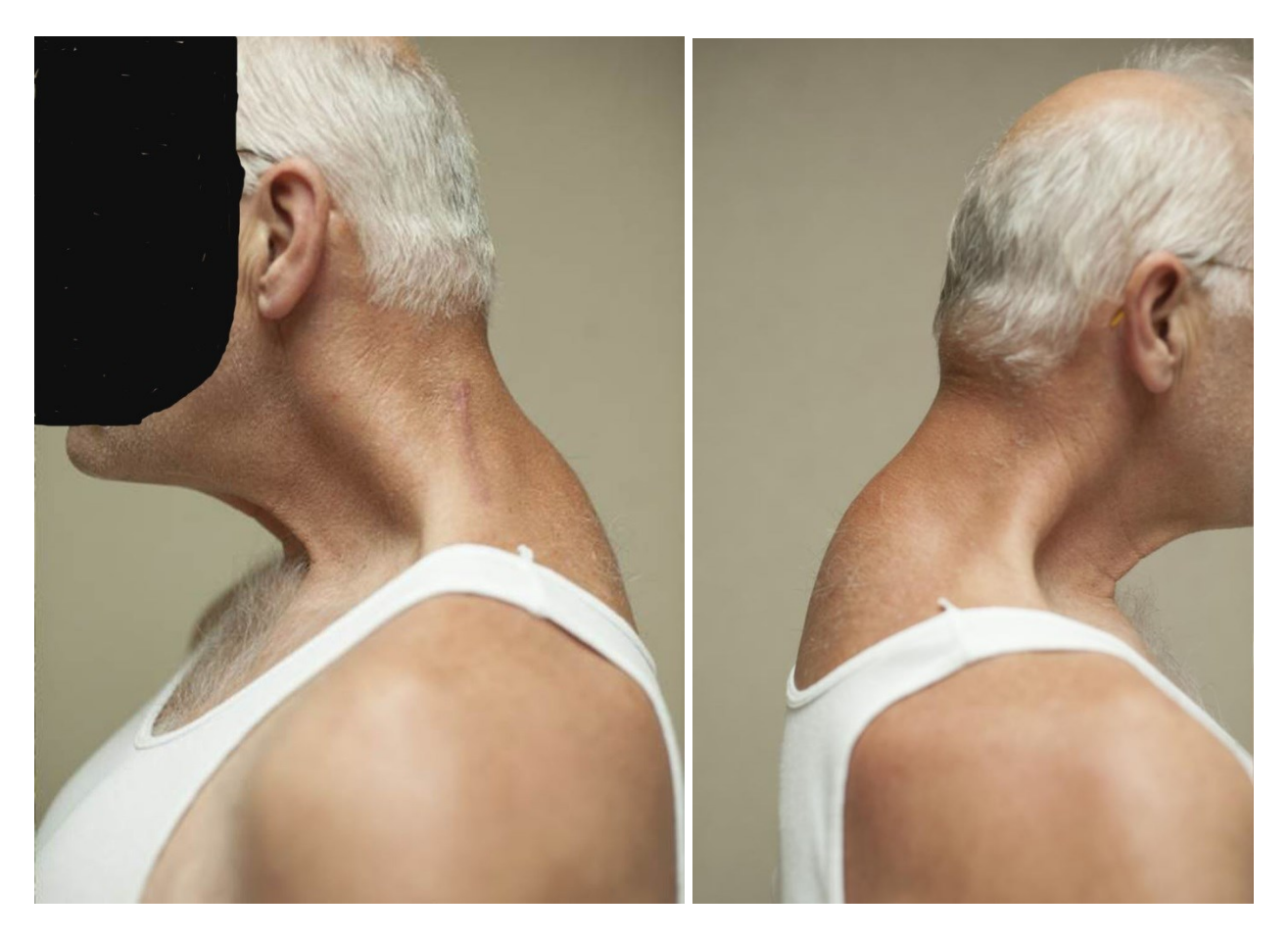
Figure 1 . Photographs of patient that demonstrate severe weakness and wasting of neck extensor muscles. Scar mark (A) shows site of muscle biopsy from left trapezius muscle.